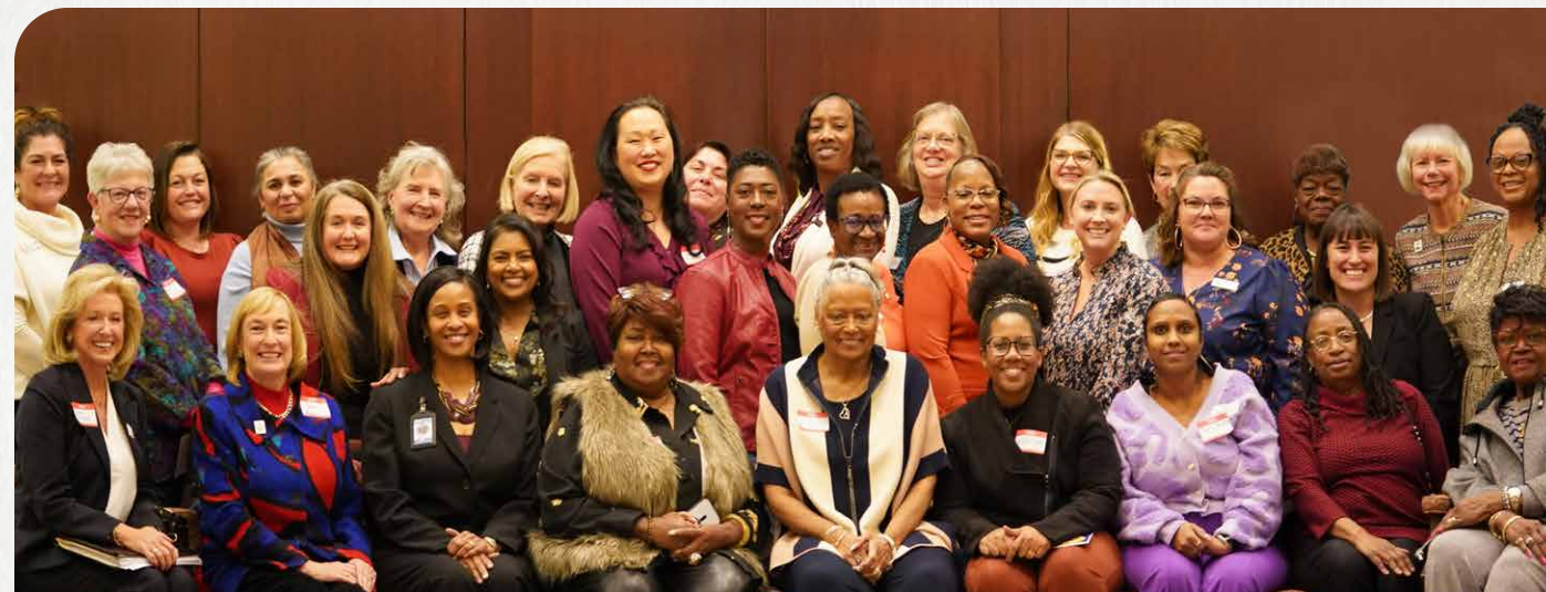
Members and grantees of the Women's Impact Fund gathered in November 2025 for an inspiring awards ceremony.

Learn more at suffolkfoundation.org by clicking on Women's Impact Fund.