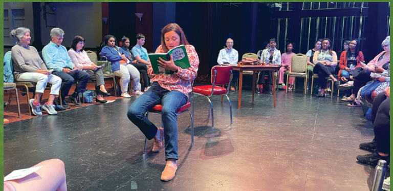
Community Impact Grants of $16,000 in 2022–2023 supported diverse art classes and performances at the Suffolk Center for Cultural Arts , including this interactive production of “Every Brilliant Thing,” in which audience members sat on stage to participate in the performance.