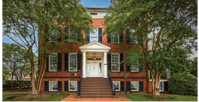
Community Impact Grants from the Suffolk Foundation have helped sustain Riddick’s Folly and its historic preservation and interpretation programs.