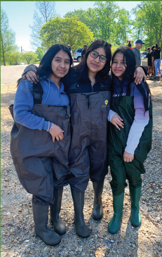
Grant funding from the Suffolk Foundation of $18,000 in 2022–2023 helped the Nansemond River Preservation Alliance bring every seventh grader in the Suffolk Public School System on science-based adventures, into the wetlands and on boat trips of the Nansemond River. Students learn about oysters, water quality monitoring, and other river ecology lessons.

Bennett's Creek Parks & Marina, Suffolk, VA.