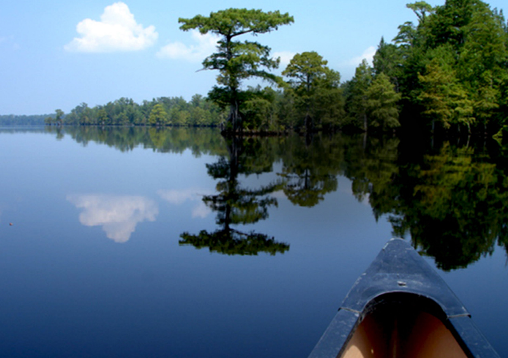
Above: Lake Drummond. Below: Great Dismal Swamp, Suffolk, VA.