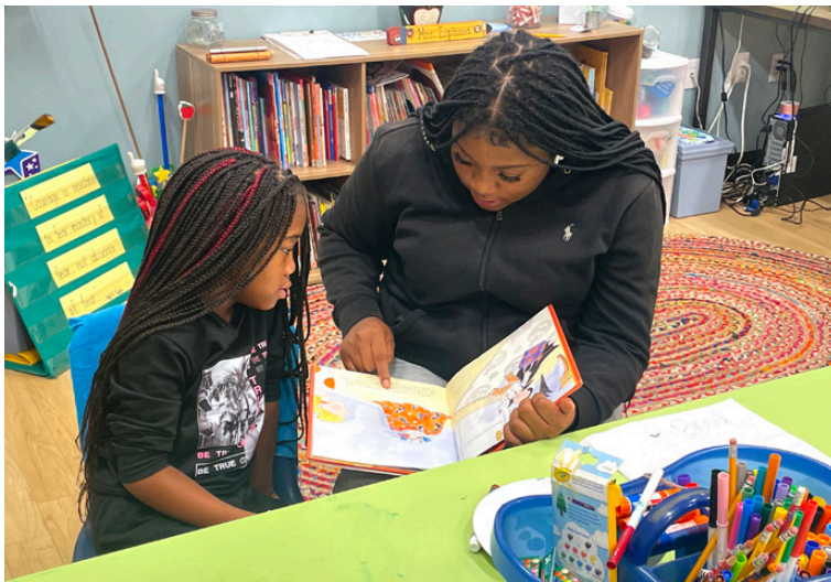
In a recent report by Project Hope, 228 students were identified as homeless in Suffolk and Western Tidewater public schools. Homelessness and housing instability profoundly impacts the educational progress for most children. With $15,000 in support from the Suffolk Foundation in 2022–2023, ForKids helped those students catch up to their peers.