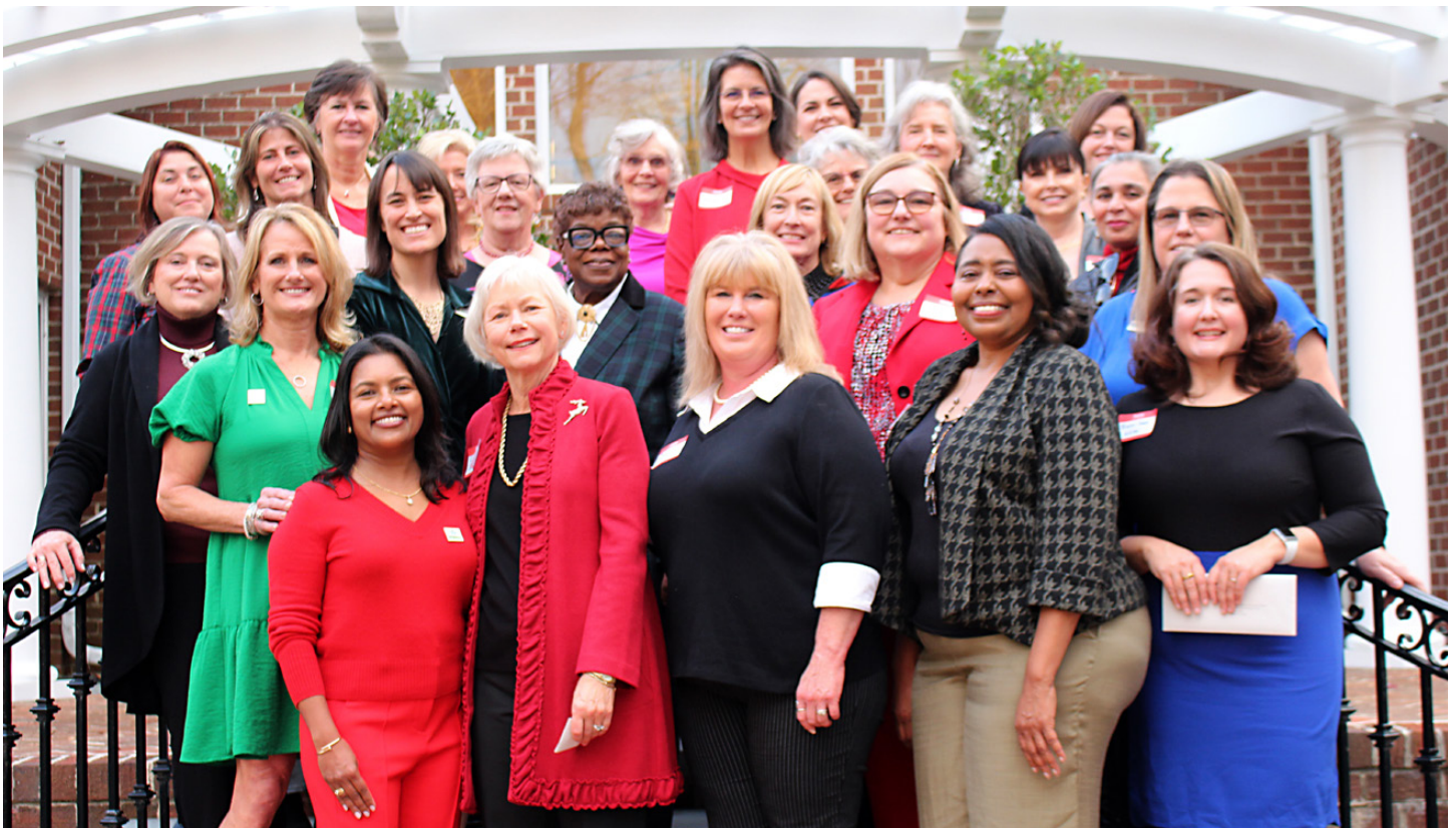
The Women’s Impact Fund of the Suffolk Foundation empowers the women and children of Suffolk and the surrounding area to lead healthy and fulfilled lives. As of 2023, the fund had 40 members and had awarded almost $25,000 in grants to area nonprofits. Above, members of the Women’s Impact Fund gathered with grantees in December 2023 to celebrate the year.

Contact us for more details about any of these options: 757-923-9090.